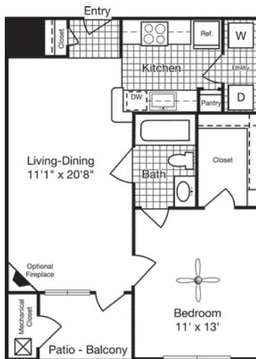
1 BR - Alexander - 633 SqFt

The Reserve at Potomac Yard / Alexandria, Virginia Sample floorplans offered by Sojourn