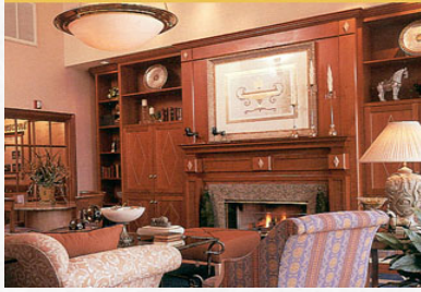
Clubhouse at Avalon Crescent